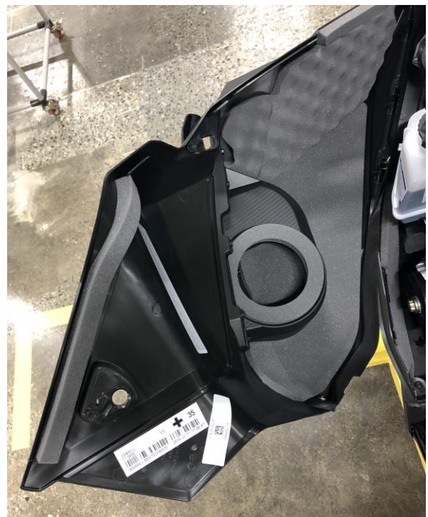
Duct on inside of Panel