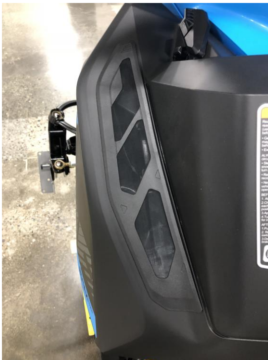
Intake vent on LH Side Panel

There are more specific improvements that have been made to each model based on their expected use, which include combinations of new engine mounts (specific designs for mountain or trail use), a finned secondary pulley, new pulley calibrations and the additional intake ducting mentioned above. Please see below for affected models and details.