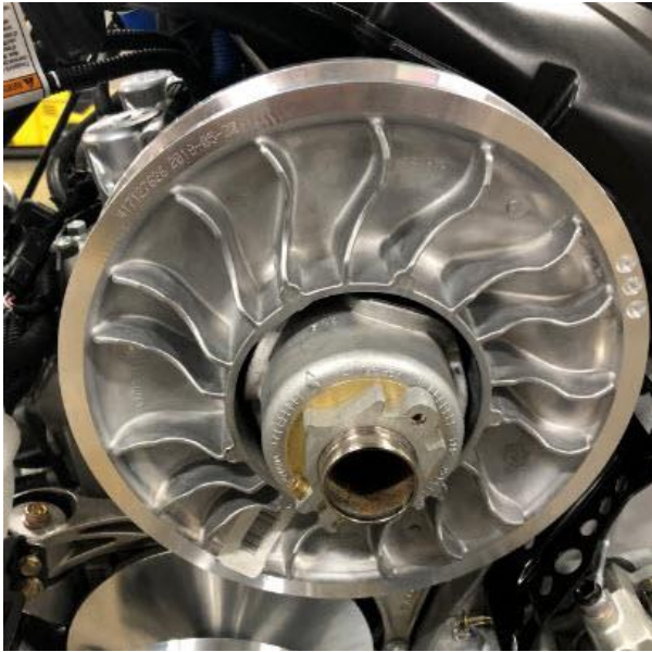
Finned Secondary Pulley